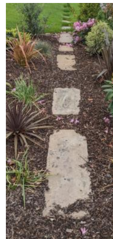
Section of the re-instated York Flagstone Path, Land Off Stone Path Drive