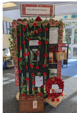
Trinity Memorial Gateway replica draped in knitted poppies, Remembrance display at the Library, November 2022