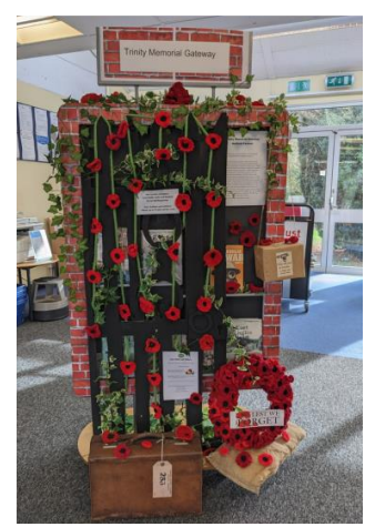
Trinity Memorial Gateway replica draped in knitted poppies, Remembrance display at the Library, November 2022