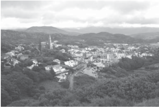
(Photo of Clifden - see what I meant about the weather!)

to a hillside site at Letterfrack about 10 miles to the north of Derrigimlagh where the company installed a second receiving station ( a prototype receiving station for the new Duplex system - a world first later used for all trans-ocean receiving stations - uh,uh, too much tech talk ) to reduce the effect of interference from the transmitter.