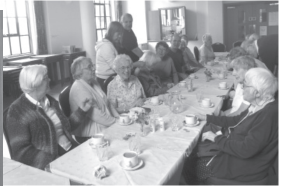
Lunch is ready! The team, left, who prepare and serve meals once a month and those, above, who enjoy the excellent food and a chat