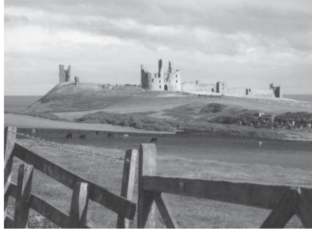
This lovely photograph was winner in the society's Autumn photographic competition for landscapes. Sorry, I have mislaid your name!

Saturday 7 May plant sale and coffee morning 10am until 12 noon at Oaklands, Nounsley Road. Wonderful plants, wonderful refreshments.