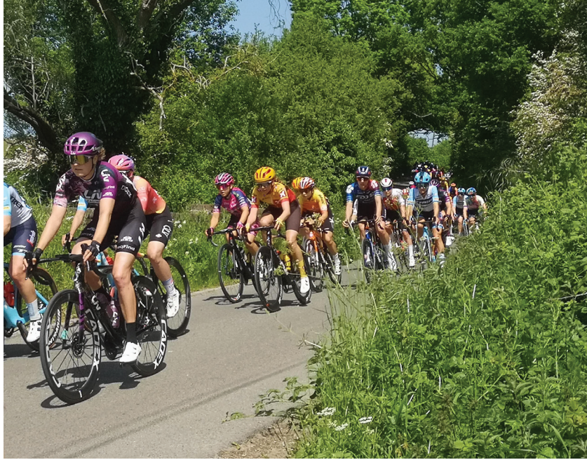
Down Crabbs Hill and over the River Ter.

The second stage of the RideLondon Classique three-day international event for elite women cyclists visited our corner of Essex on Saturday 27 May. Day one took the riders on a route around the northern boundary of Essex, starting in Saffron Walden and ending in Colchester. On Saturday Stage 2 started and finished in Maldon, following a convoluted route from there to Abberton, Birch, Tiptree, Wickham Bishops, Heybridge, then three laps from Heybridge around Nounsley, Little Baddow and Woodham Walter to the final finish in Maldon.